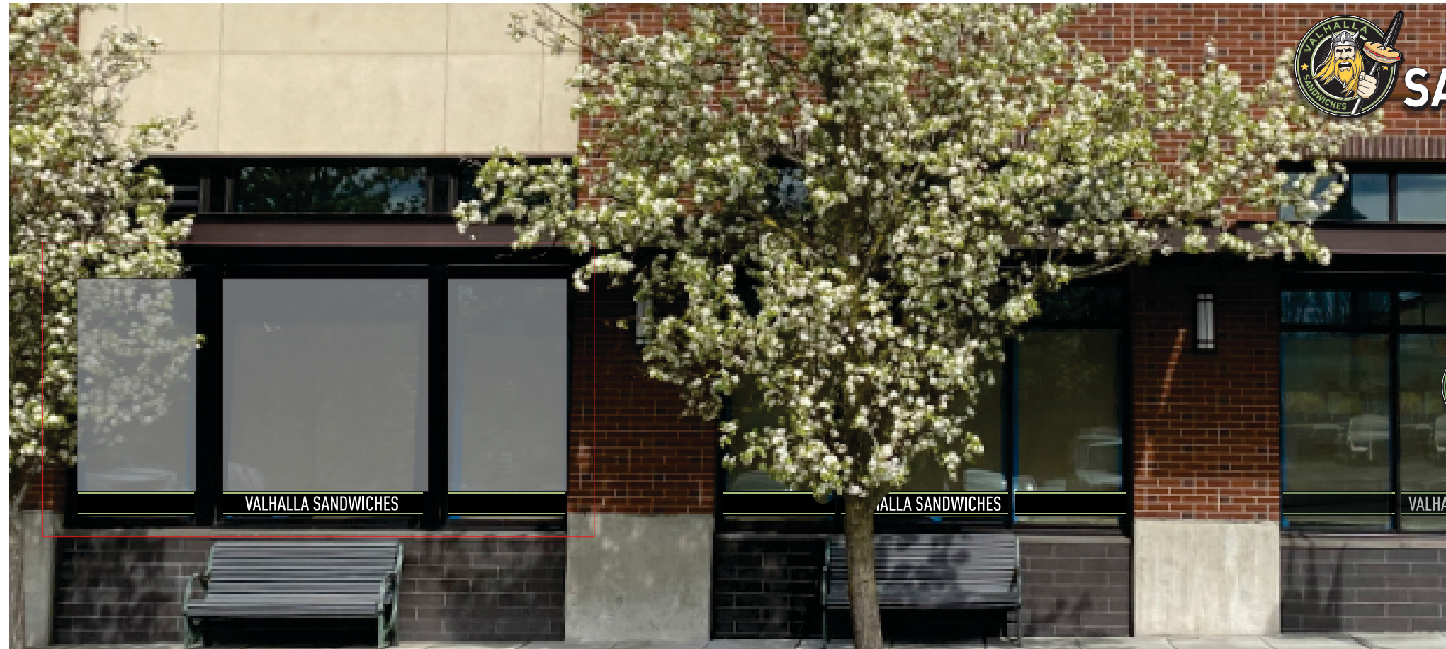
OBSCURED GLASS VINYL WINDOW OVERLAYS - D