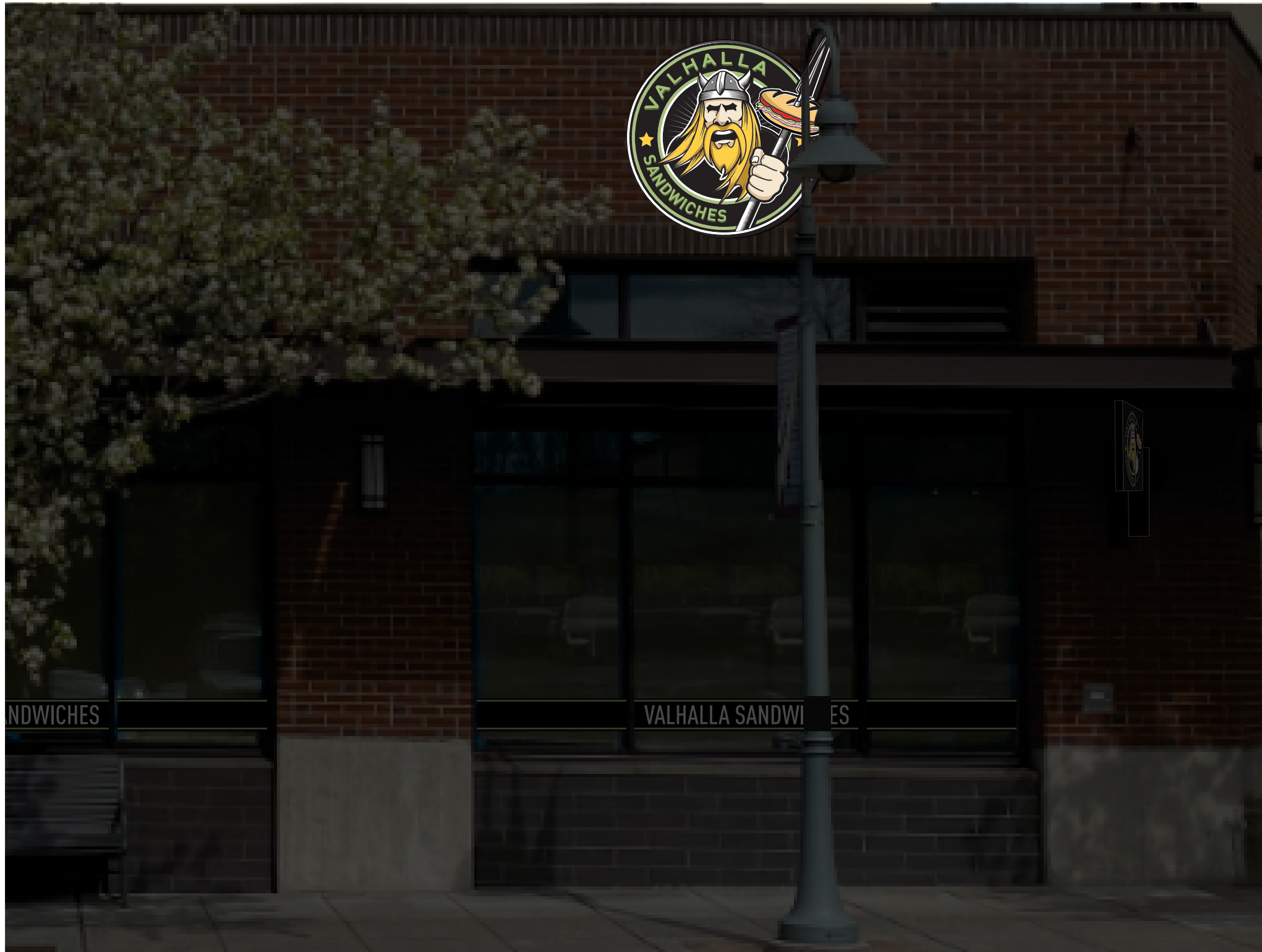
SIGN A - SIMULATED NIGHT RENDERING