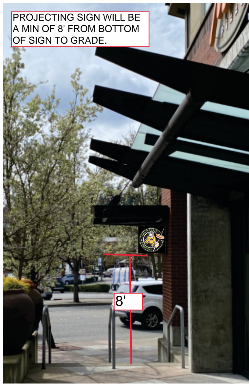
PROPOSED SIGN B