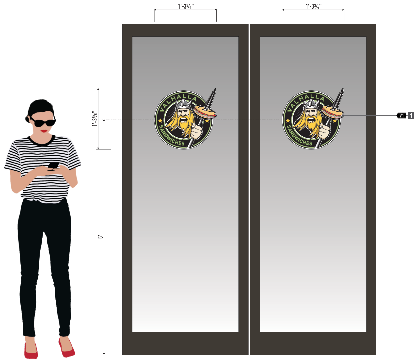
E ENTRANCE DOOR VINYL LOGO QUANTITY 2. MANUFACTURE & INSTALL