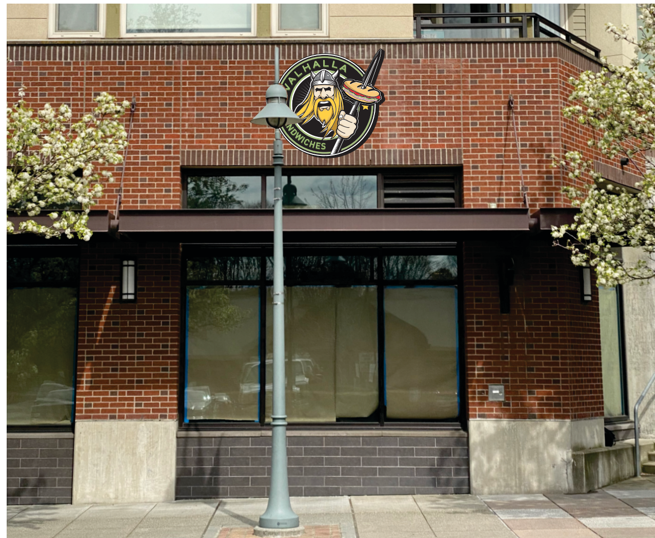
PROPOSED SIGN A OPTION 1