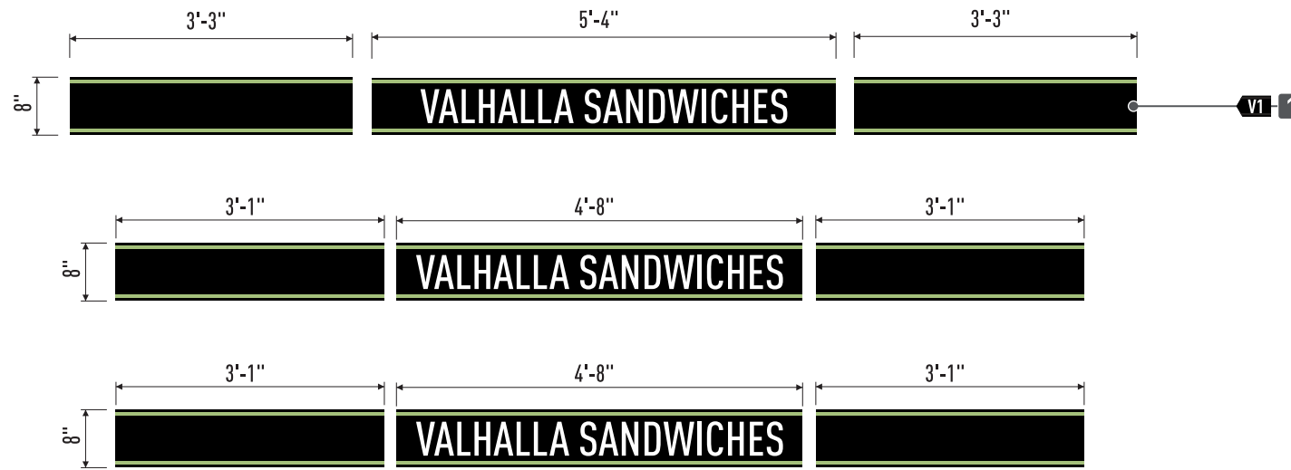
C VINYL WINDOW GRAPHICS BANDS QUANTITY 1. MANUFACTURE & INSTALL